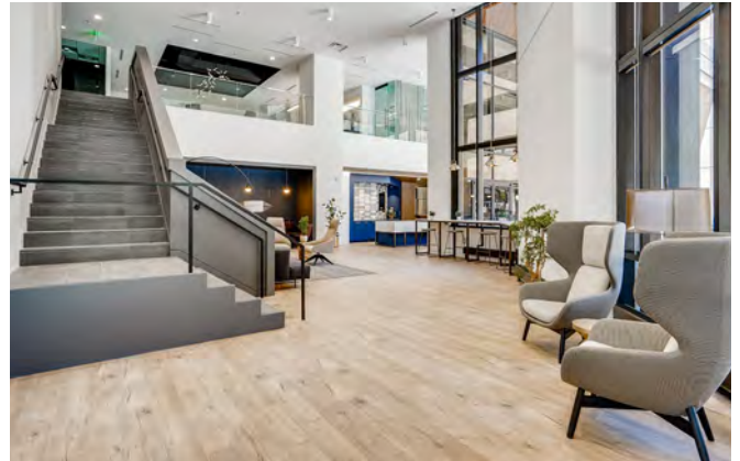
Amenity Center Entry