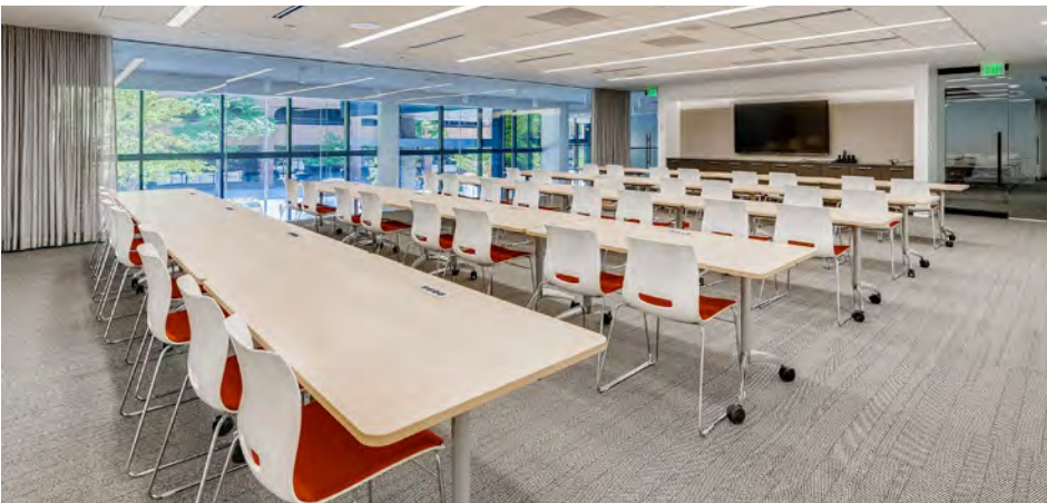
Event Training Room