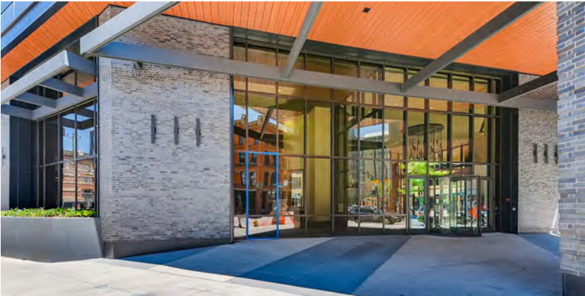
Modern Street Experience