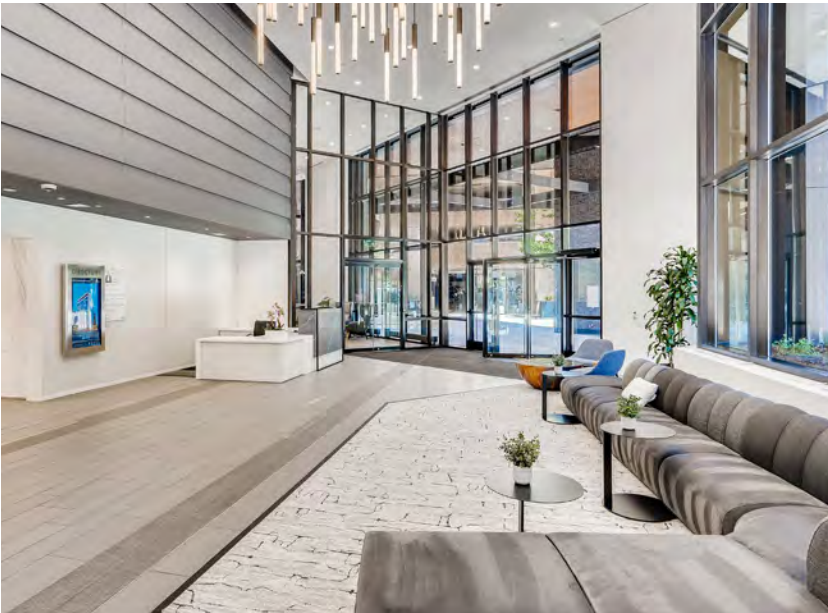
New Contemporary Lobby