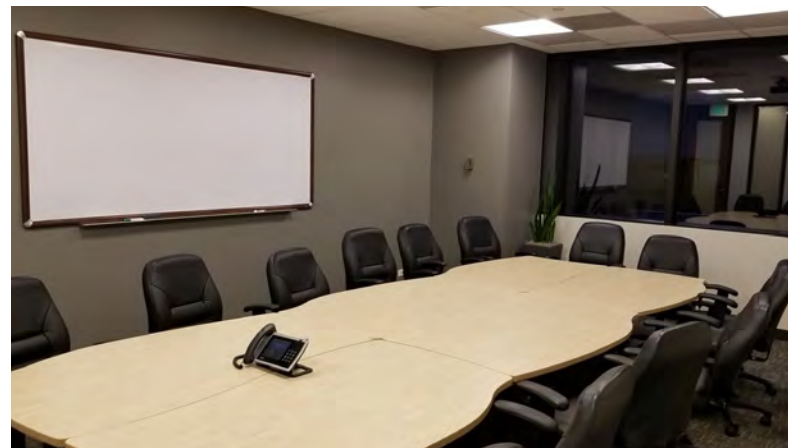
In-Building Conference Room