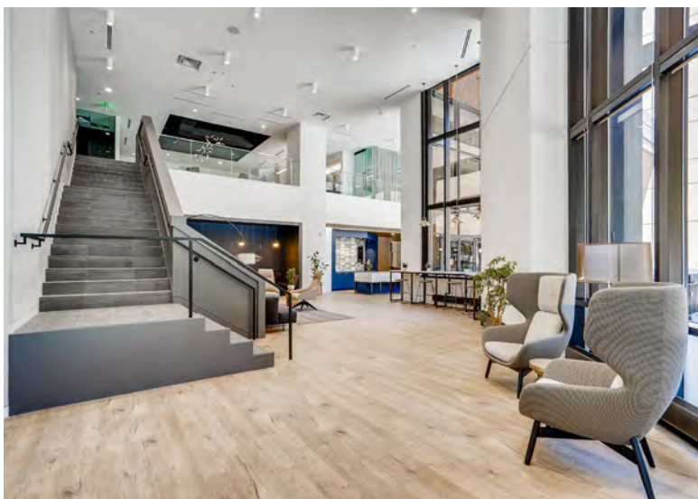
Project Amenity Center