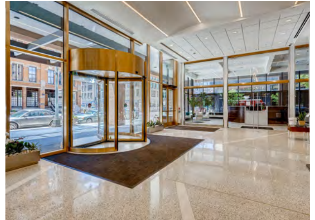
Upgraded Building Entry