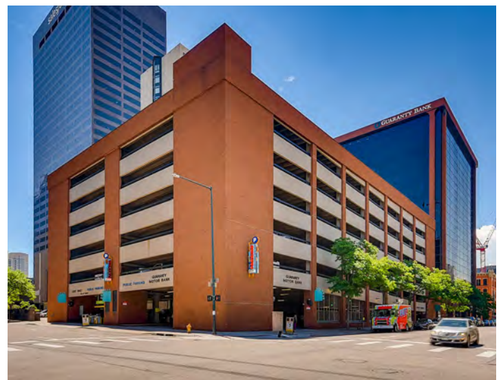
Generous Attached Parking Garage

CIM A CIM Operated Property CIM is a community-focused real estate and infrastructure owner, operator and lender. Leasing information: www.cimgroup.com